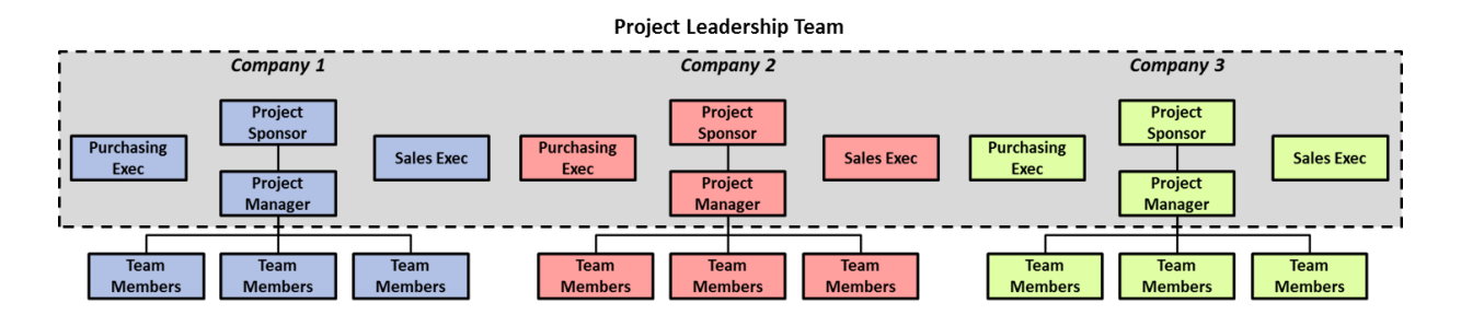
Figure 1: Project Leadership Team Structure

The Project Management Institute a defines a project sponsor as the person within the company that has ownership of the project with the ability to assign resources, set priorities, and make major decisions on the project. Frequently the project manager reports to the project sponsor. These project sponsors are usually key executives, divisional managers, board members, or presidents within their respective companies. The Project Leadership Team is made up of the project sponsors, project managers, and representatives from sales or purchasing (Figure 1).